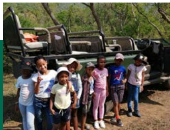
School game drives