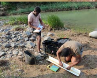
Research on mottled eel

This programme continues to grow in popularity, furthering the sustainability of UmPhafa's work in the future.