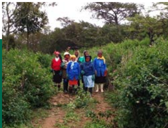
Community clearing alien plants