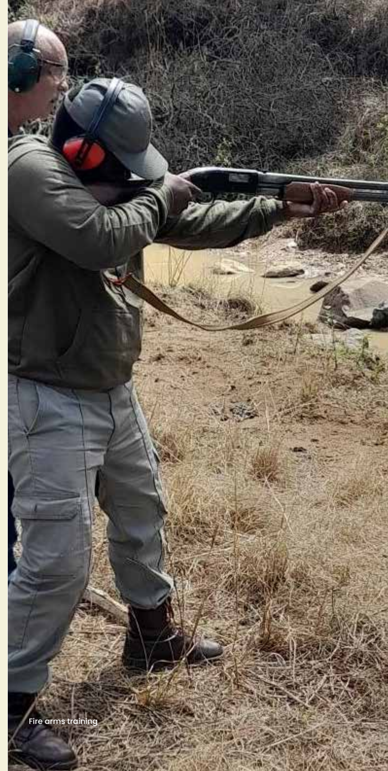
Fire arms training