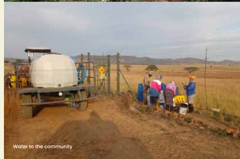
Water to the community