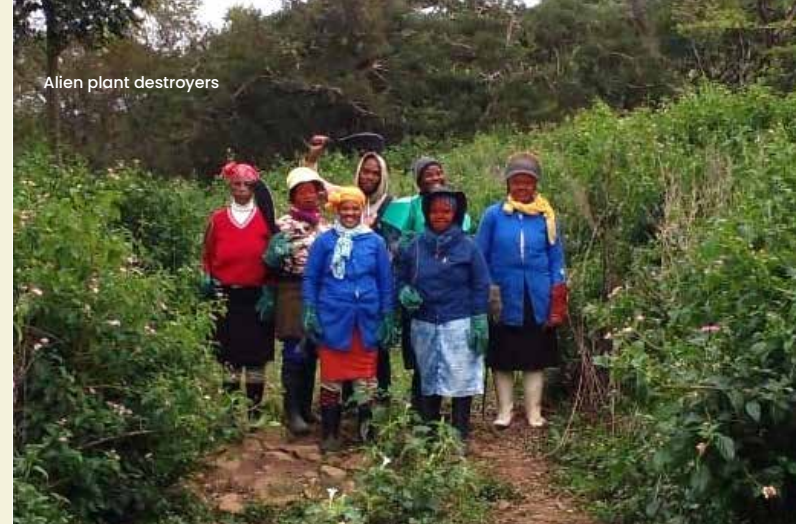
Alien plant destroyers